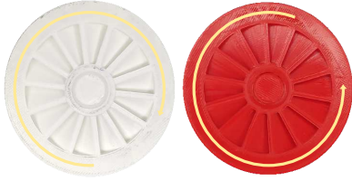
Fig. 1. Picture of two 3D-printed particles, the natural spinning direction is indicated with arrows. We have printed them in different colors to tell them apart with our computer-vision tracking algorithms.

In our work we study the fundamental properties of the dynamics in a binary mixture of active 3D-printed spinners. We have fabricated two sets of rotors provided with blades, these two sets are identical except for the fact that they have opposite natural spins (due to inverse blade tilt angles). The system is fluidized by a tunable air flow one clockwise, in this way, particles are provided with continuous rotation, so that one species spins clockwise (CW) and the other counter-clockwise (CCW). Moreover, turbulent streamlines generated by the upflow past the disks also provide them with Brownian-like translational motion [1].